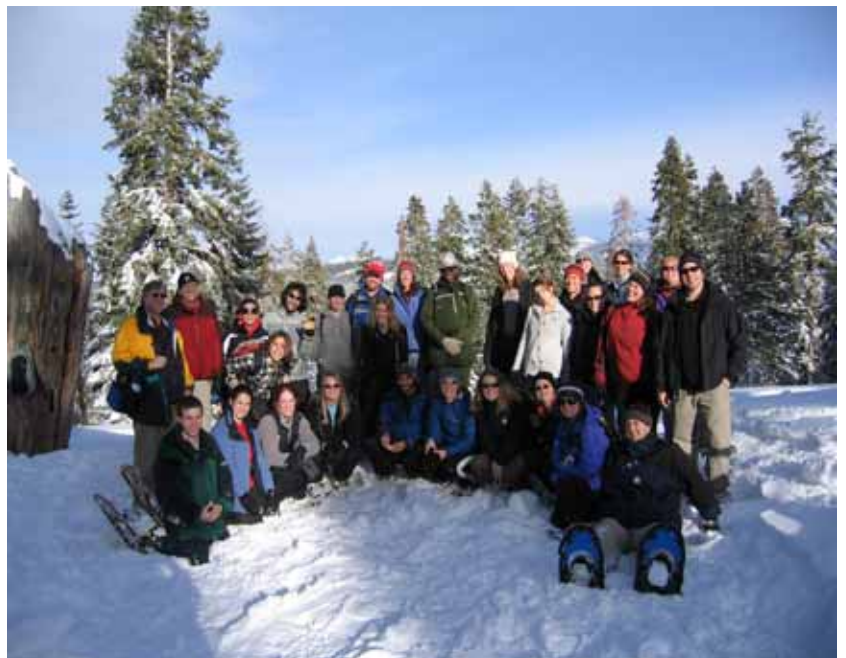
2008 SNAP Members during a snowshoe tour in Yosemite National Park at Badger Pass.